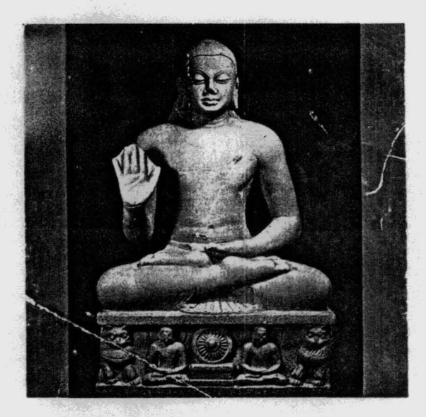
Gupta-age Buddha: An ideal body shape