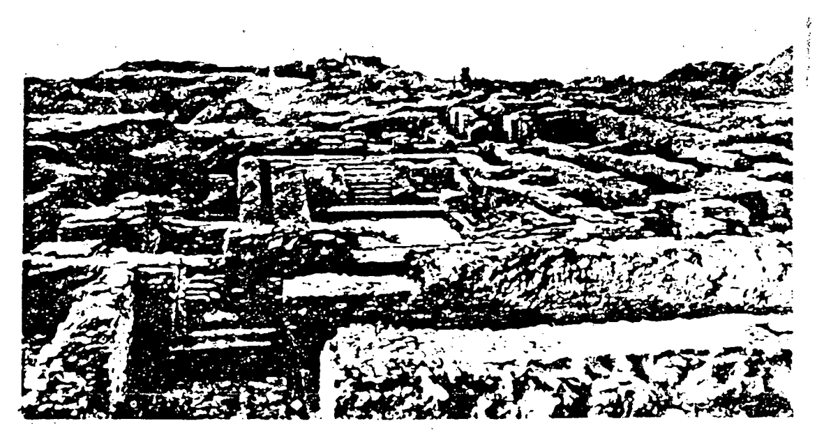
Great Bath, Mohenjo-daro

support kilns which produced them. Probably this along with other reasons possibly led to the desertion of the Harappan regions and the subsequent decline of the civilization.