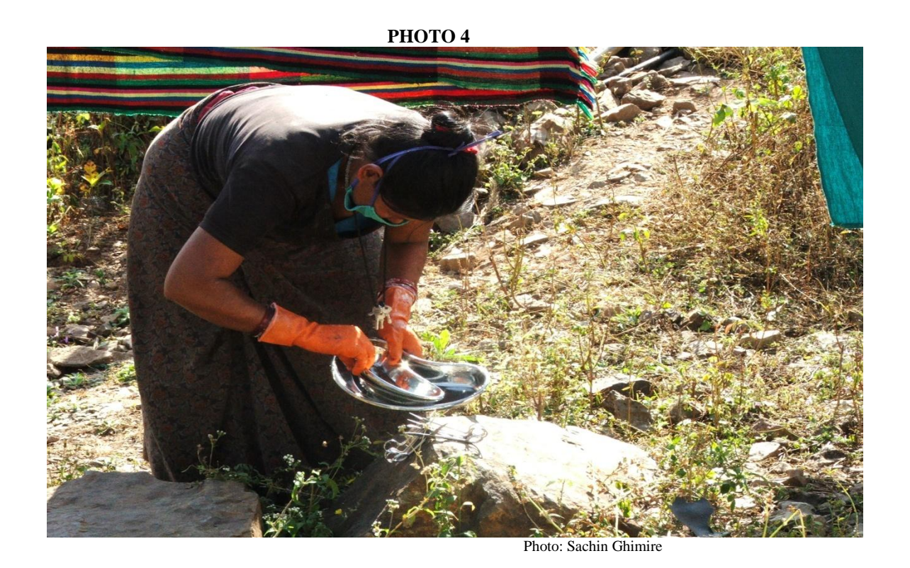
In district hospital, drying surgical apparatus in sunlight.