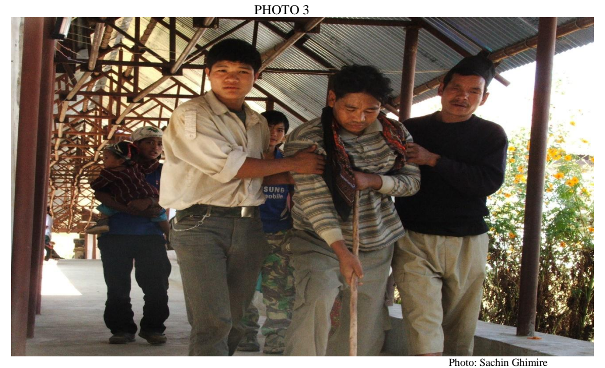
District hospital does not have wheelchair for patients.