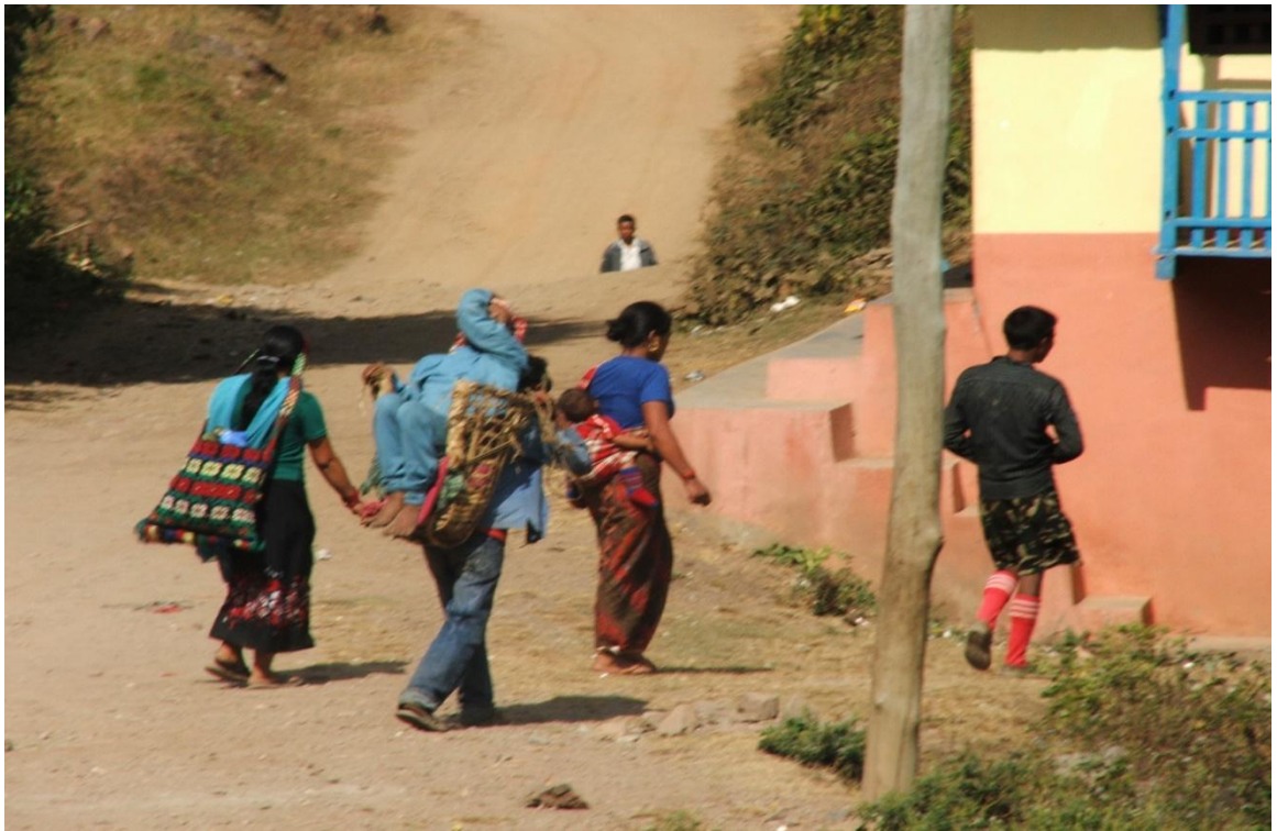
Bamboo basket (Doko) is used to carry patient to reach District Hospital