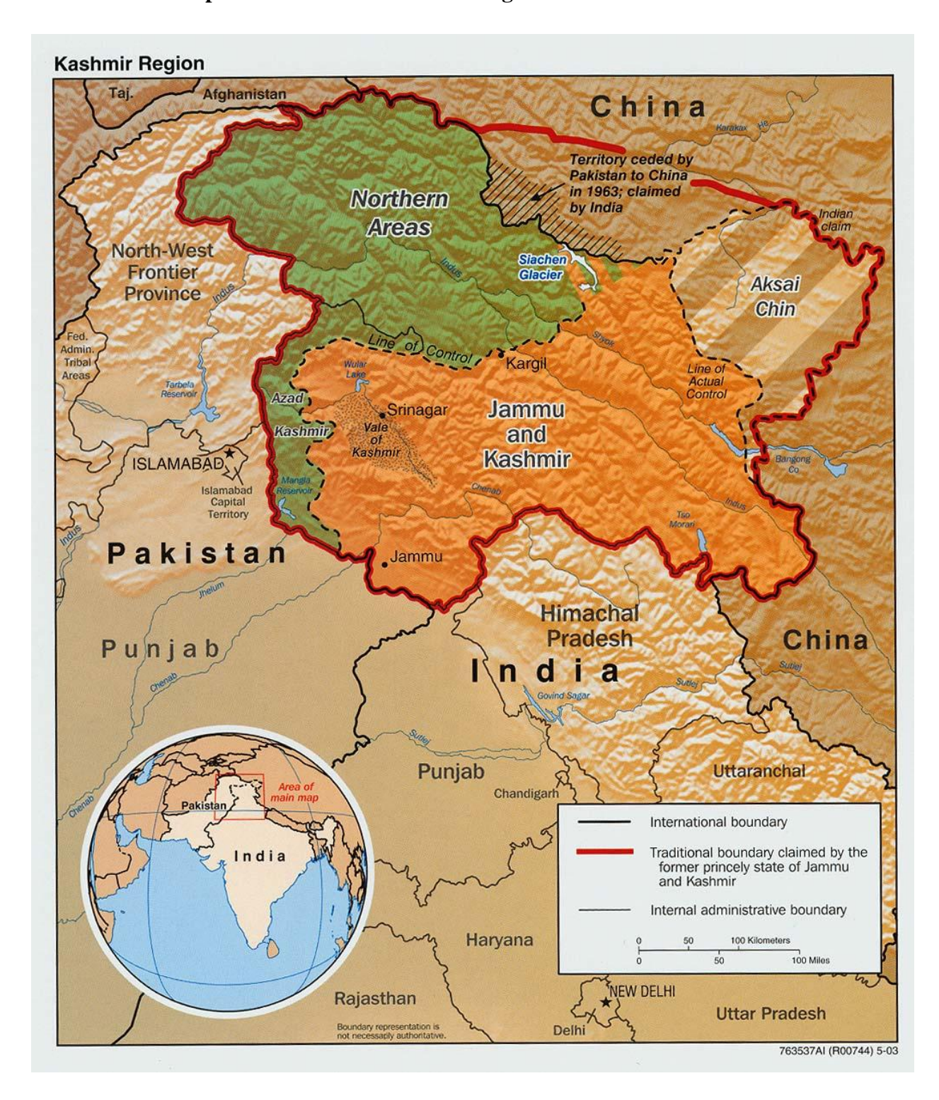
APPENDIX I: Map of Jammu and Kashmir along with POK and Aksai Chin.